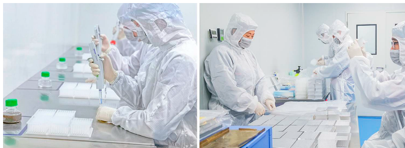
Figure 2. Scientists were developing the COVID-19 diagnostic kit during the Chinese New Year.